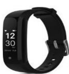
Tempo 2 (HR)

The following HPB fitness Trackers are supported by the Healthy 365 app for the National Steps Challenge™: