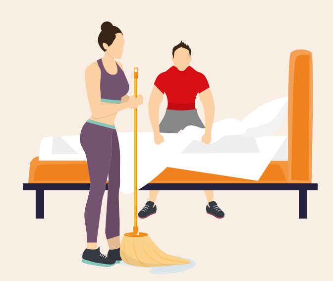
Housework 30 mins