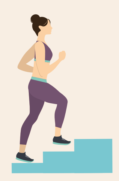
Climb stairs 15 mins