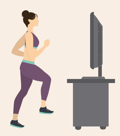
Jog on the spot 30 mins