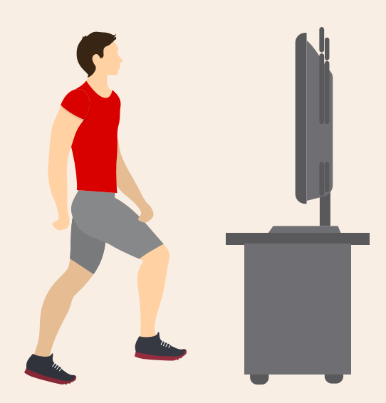
Walk on the spot 30 mins