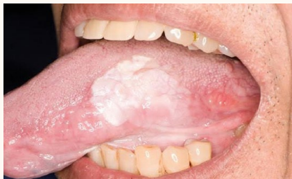
White patches in your mouth