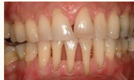
Receding gum lines