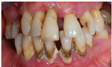
Loose or shaky adult teeth and/or widening gaps between your adult teeth