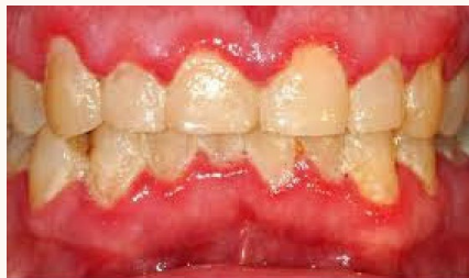
Persistent bleeding gums