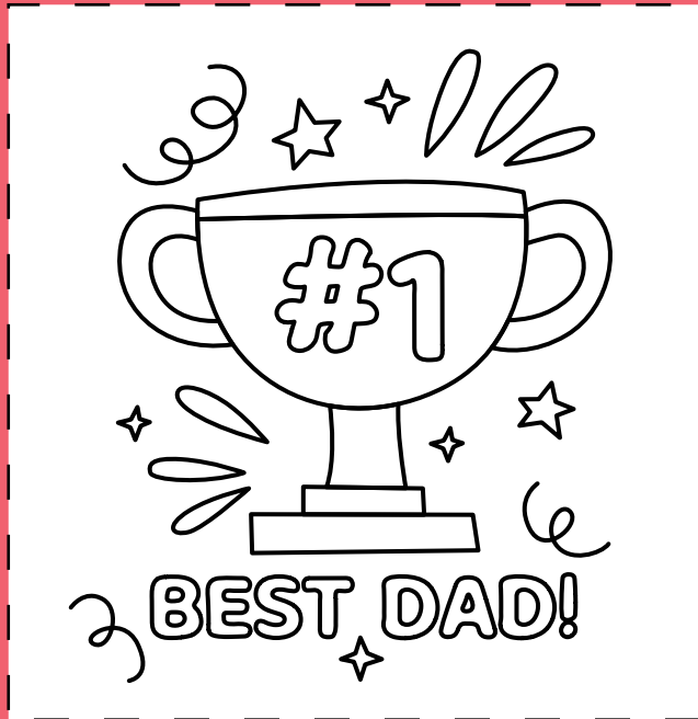
Father's Day Card